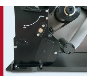
Fixed Metal Chassis Frame stable performance to handle heavy workloads