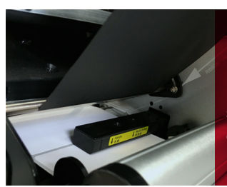
Up/Down Reflective Media Sensor super media compatibility